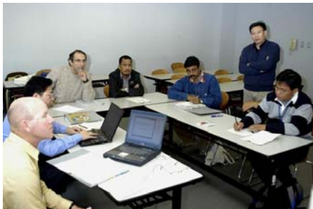
Yangtze River Basin Team