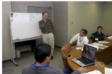
Mekong River Basin Team