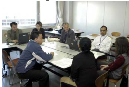
Lower Colorado River Basin Team