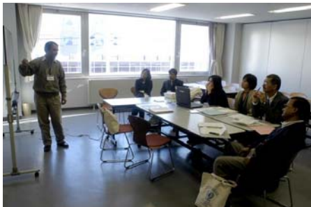
Indus River Basin Team