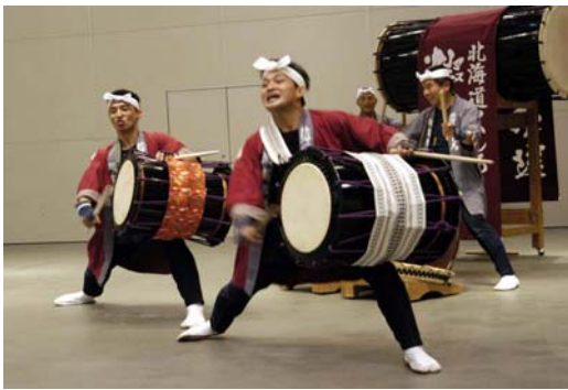
Taiko (Japanese drums) performance by Kushiro citizens

As a training institute of the United Nations, UNITAR gives primary importance to the development of training methodologies which will facilitate the acquisition of ready-to-use knowledge in a limited time (less than one week) among its participants, who are commonly mid to high level government officials. Various methodologies are thus applied, including After-Action-Review (AAR) and Peer Review, and are refined at each of its training sessions.