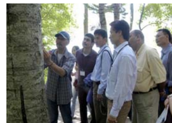
Monitoring of trees

The second day of the study tour began with a visit to the Akan Lake Eco Museum Centre where the participants received a lecture about marimo , an algal species found in the lake. Dr. LEI Guangchun then introduced the participants to the Ramsar nomination procedure and its nine specific criteria. The participants were given the following questions to consider during the study tour: what were the ecosystem functions and services provided at Akan Lake?