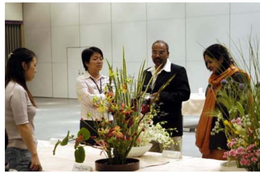
Ikebana (flower arrangement) demonstration