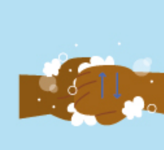
RUB BACKS OF FINGERS ON OPPOSING PALMS