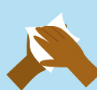
DRY WITH TOWEL