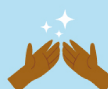
YOUR HANDS ARE CLEAN