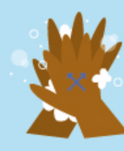
SCRUB BETWEEN FINGERS