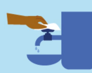
USE TOWEL TO TURN OFF FAUCET