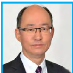
Mr. Rio Hada

Office of the High Commissioner for Human Rights (OHCHR) Focal Point on the Human Rights of Older Persons