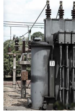
In person training