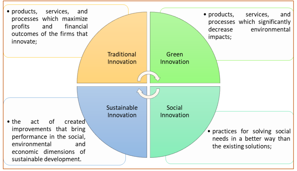
Figure 01: The four types of innovation

would be met by recombining existing technologies and knowledge. The authors present four types of innovation as can be observed in figure one below.