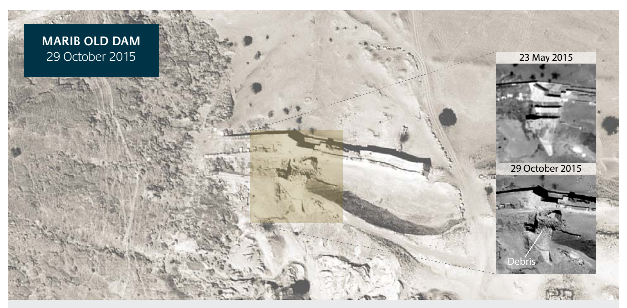
Source: Marib, Yemen, 29 October 2015. © US Department of State, Humanitarian Information Unit, NextView license. Satellite imagery analysis by UNITAR-UNOSAT.

The Historic city of Sa'adah, listed on Yemen's Tentative List for potential nomination for World Heritage inscription since 2002, has suffered extensive damage as a result of the ongoing conflict, with many historic buildings, including the Imam al-Hadi mosque, severely affected. UNOSAT's satellite imagery, based damage assessment identified a total of 136 affected structures. Approximately 31 structures were destroyed, 38 were severely damaged, and 67 were moderately damaged within the Old City of Sa'adah limits.