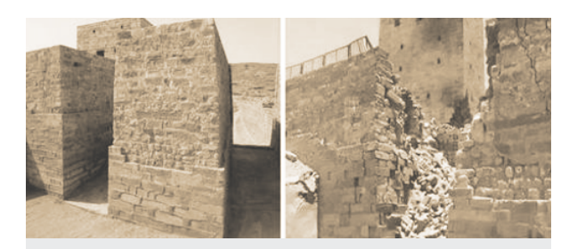
Marid Old Dam before and after image. Satellite imagery collected on 29 October 2015 shows one of the retention towers severly damaged with visible debris in the middle section of the Southern Dam sluice.

Situated in a mountain valley at an altitude of 2,200 m. the Yemeni capital, Sana'a , has been inhabited for more than 2,500 years and bears witness to the wealth and beauty of Islamic civilization. This religious and political heritage can be seen in the 103 mosques, 14 hammams and over 6,000 houses, all built before the 11th century. By the first century AD, it emerged as the centre of the inland trade route and its houses and public buildings are an outstanding example of a traditional, Islamic human settlement. Sana'a's dense rammed earth and burnt brick towers, strikingly decorated, are famous around the world and are an integral part of Yemenis's identity and pride. The Old City of Sana'a was inscribed on UNESCO's World Heritage List in 1986. In 2015, it was added to the List of World Heritage in Danger, owing to the ongoing conflict that has severely damaged many of the historic buildings of the city. Satellite imagery collected 8 July and 23 September, 2015 identify several 11th century houses which were completely destroyed.