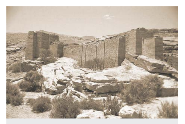
Marib Old Dam before destruction. Photo credit: Jordi Zaragozà Anglès, Mikaku planet, 1995(www.mikakuplanet.com).