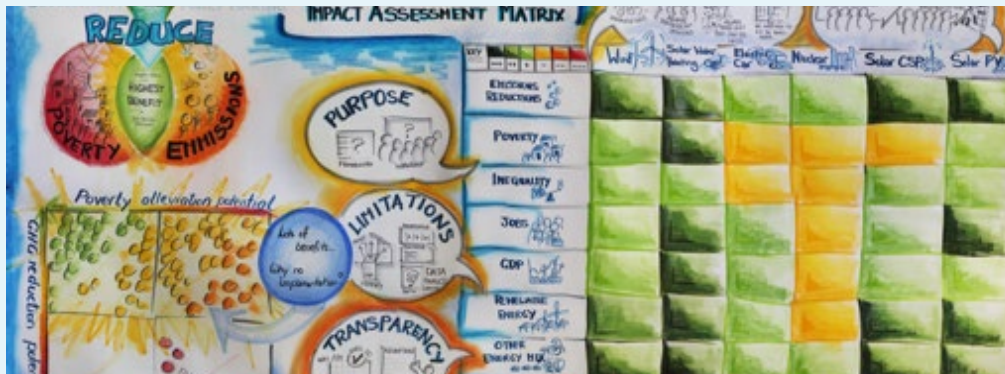
AIM Matrix (ERC-UCT)

under review (solar water, CSP, photovoltaic, wind power, electric car and nuclear) rating them in terms of their impact on the different goals, based on quantitative results and on lessons learned from national and international case studies. The group concluded that the contribution of each of these technologies to GHG mit-